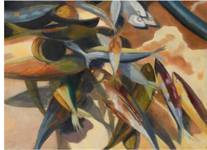
Smoked Fish oil on canvas 42 x 58 cm

First published in 2023 by Campden Gallery Ltd, High Street, Chipping Campden, Gloucestershire GL55 6AG www.campdengallery.co.uk