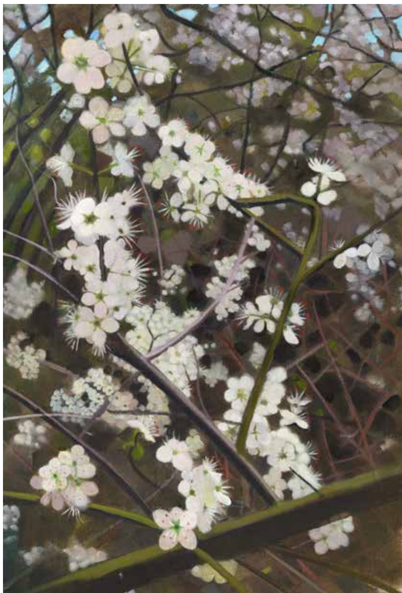
Hawthorn oil on canvas 69 × 47cm