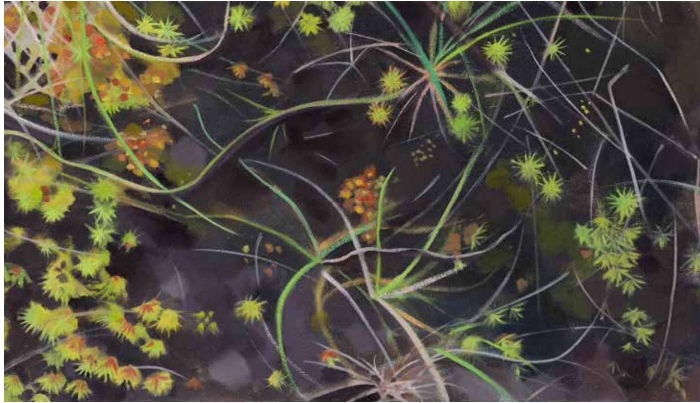
Soil Dance oil on canvas 44 x 68 cm