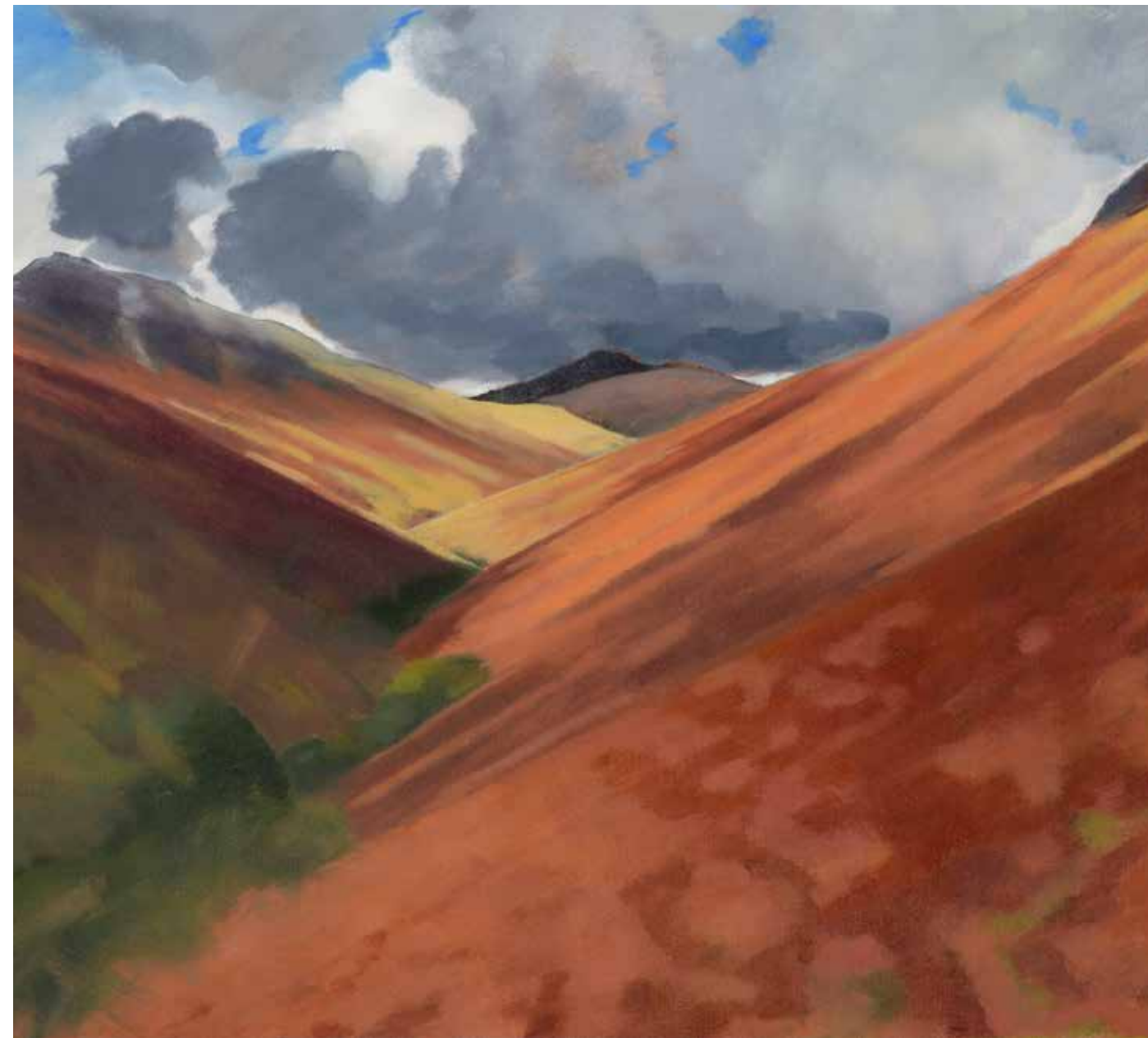
Cumbrian Valley oil on canvas 75 × 84 cm