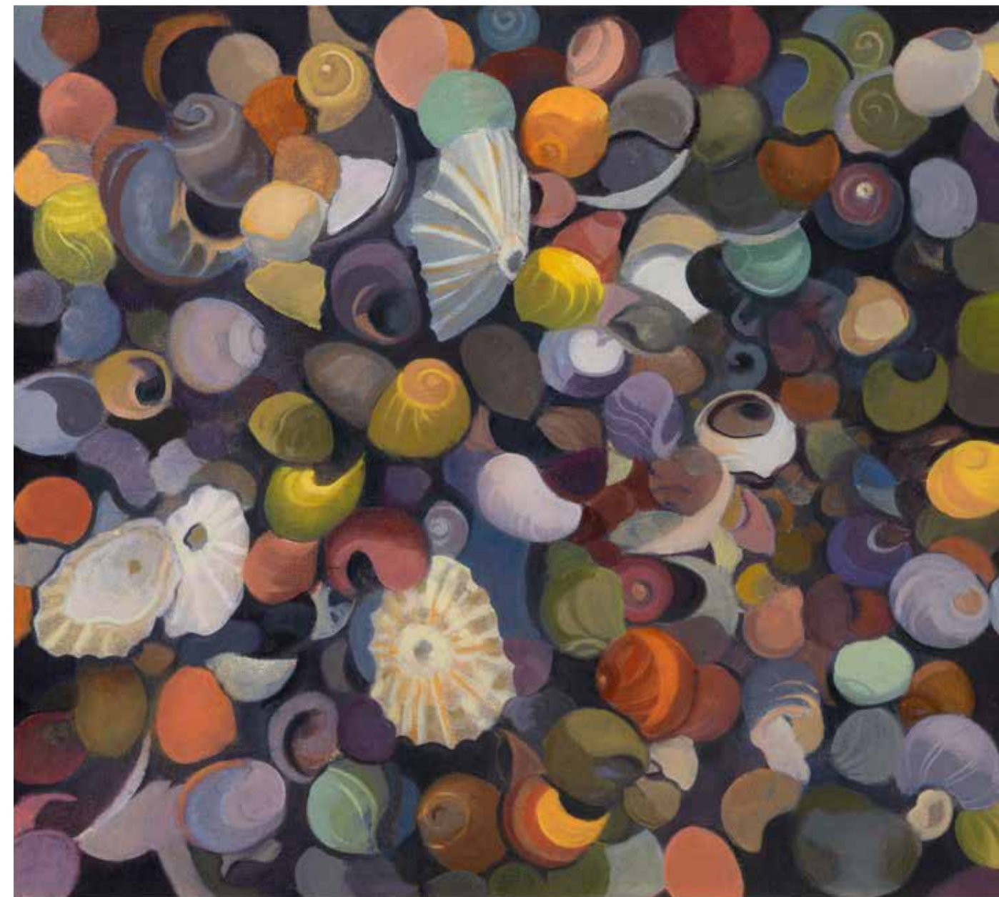
Shell Cluster, Colonsay oil on canvas 61 x 69 cm