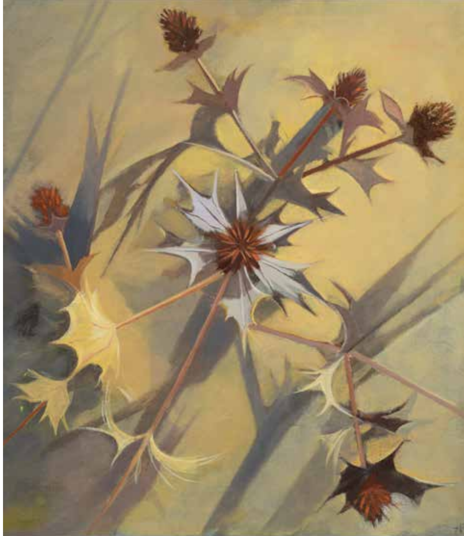
Winter Sea Holly oil on canvas 57 x 50 cm