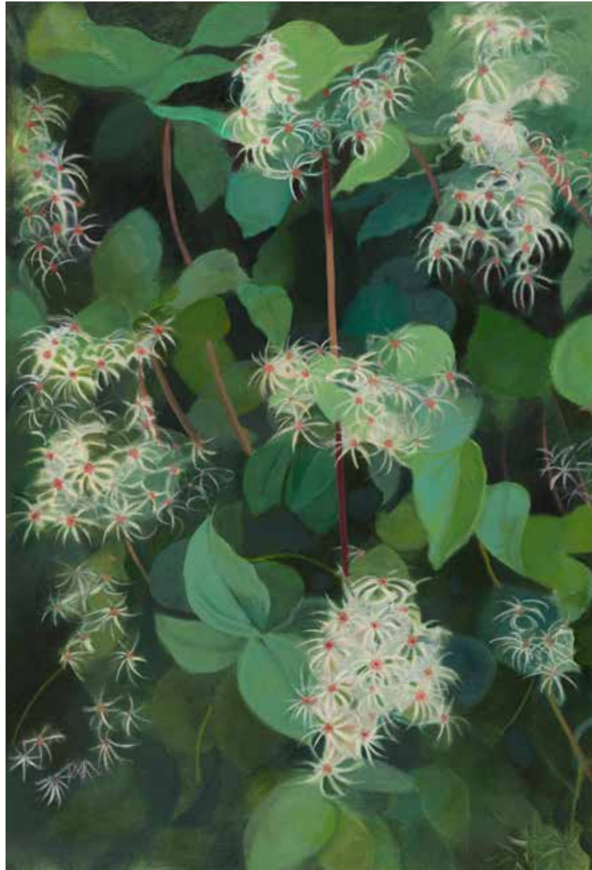
Old Man's Beard oil on canvas 74 x 51 cm