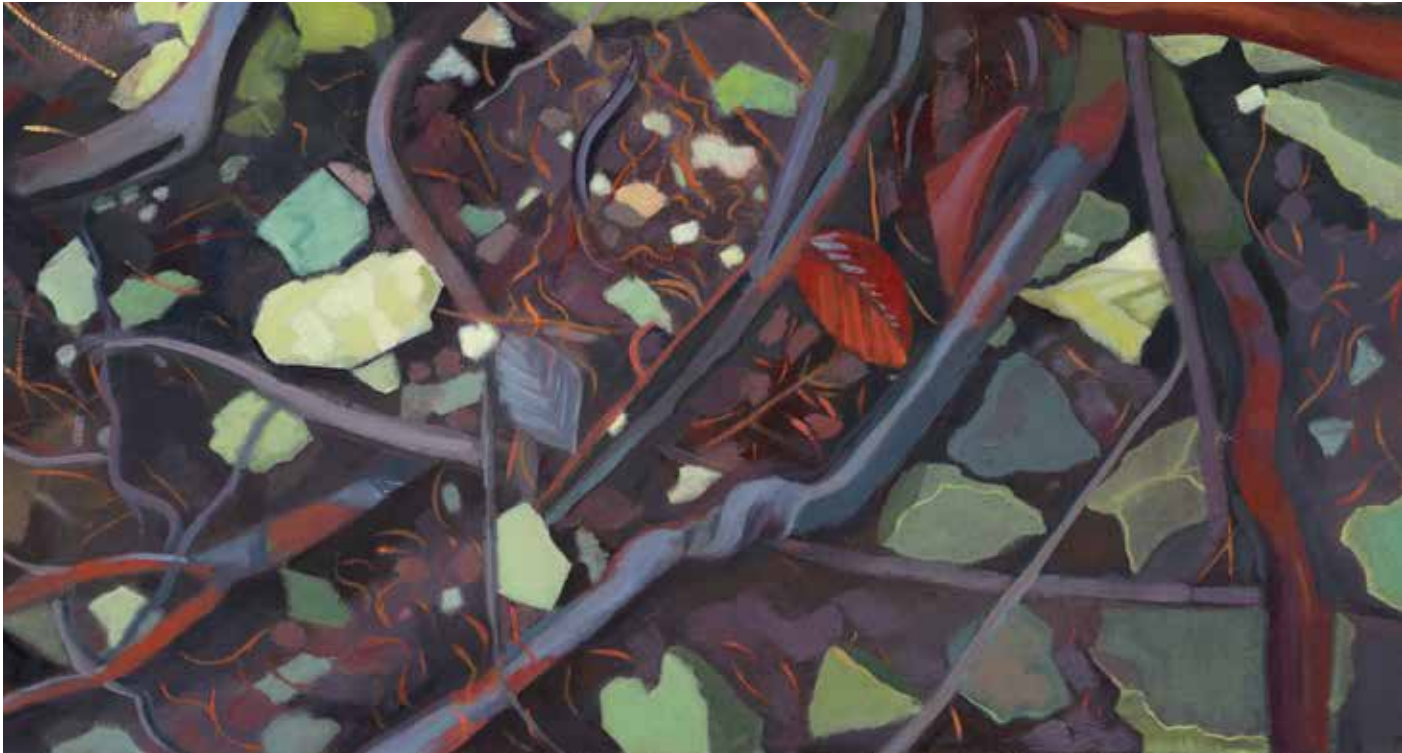
Flints and Roots oil on canvas 44 x 72 cm