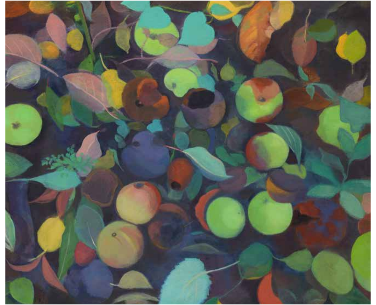
Autumn Floor oil on canvas 62 x 74 cm