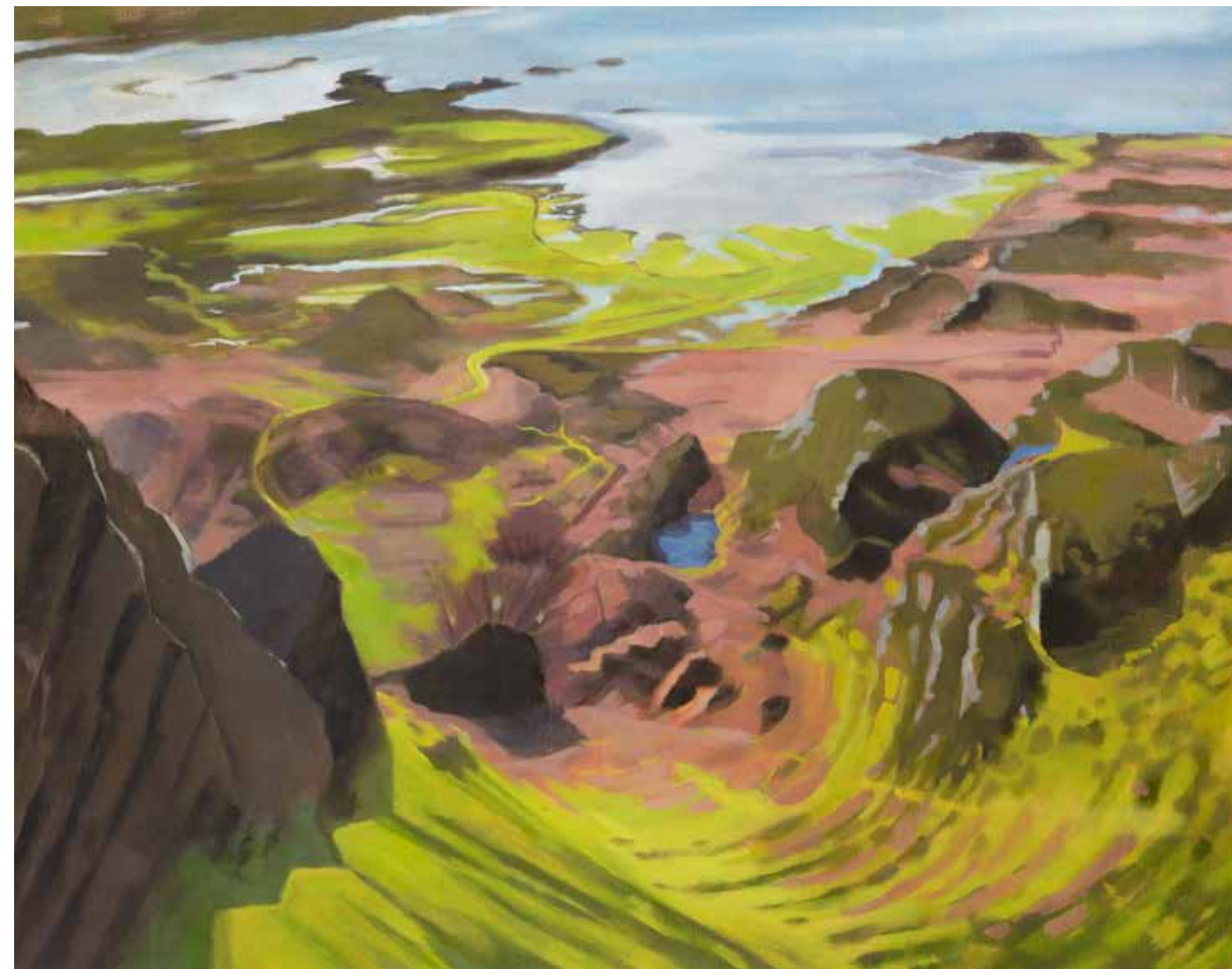
Towards Oronsay oil on canvas 78 x 98 cm