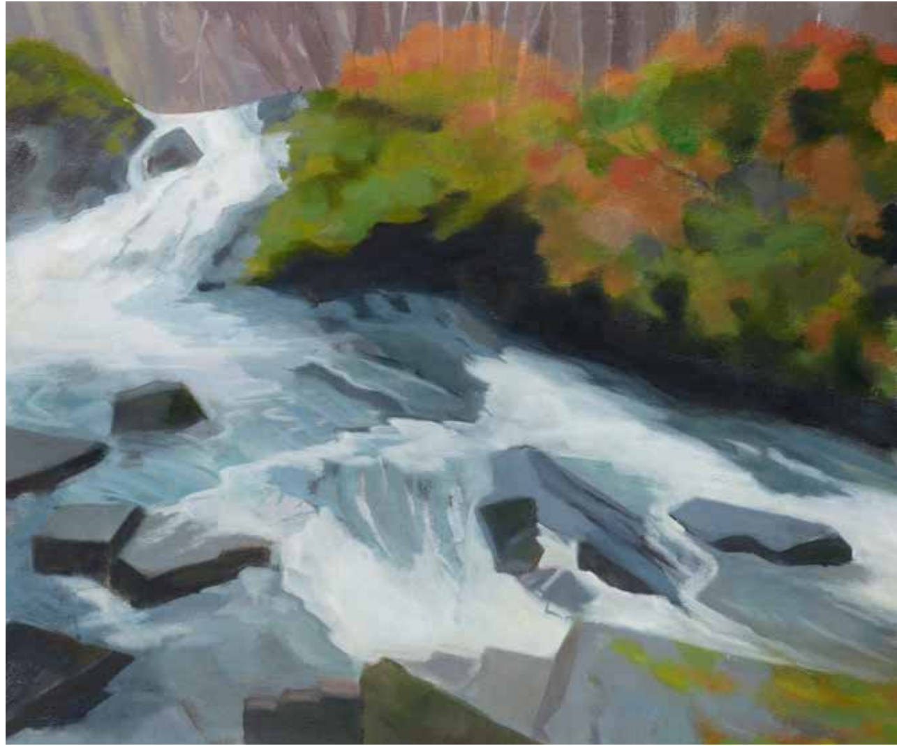
Falling Water (Assynt) oil on canvas 62 x 73 cm