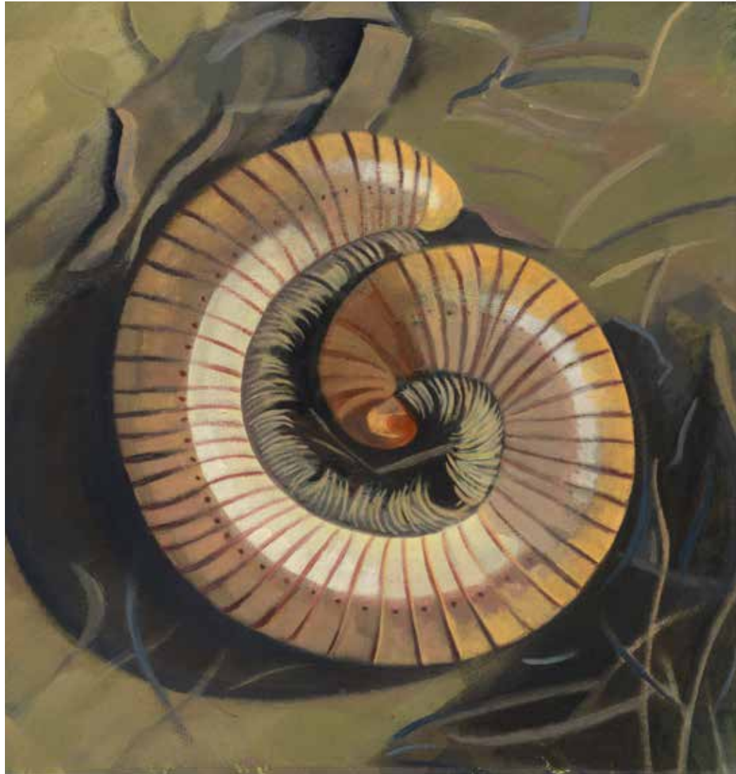
Millipede oil on canvas 54 x 50 cm