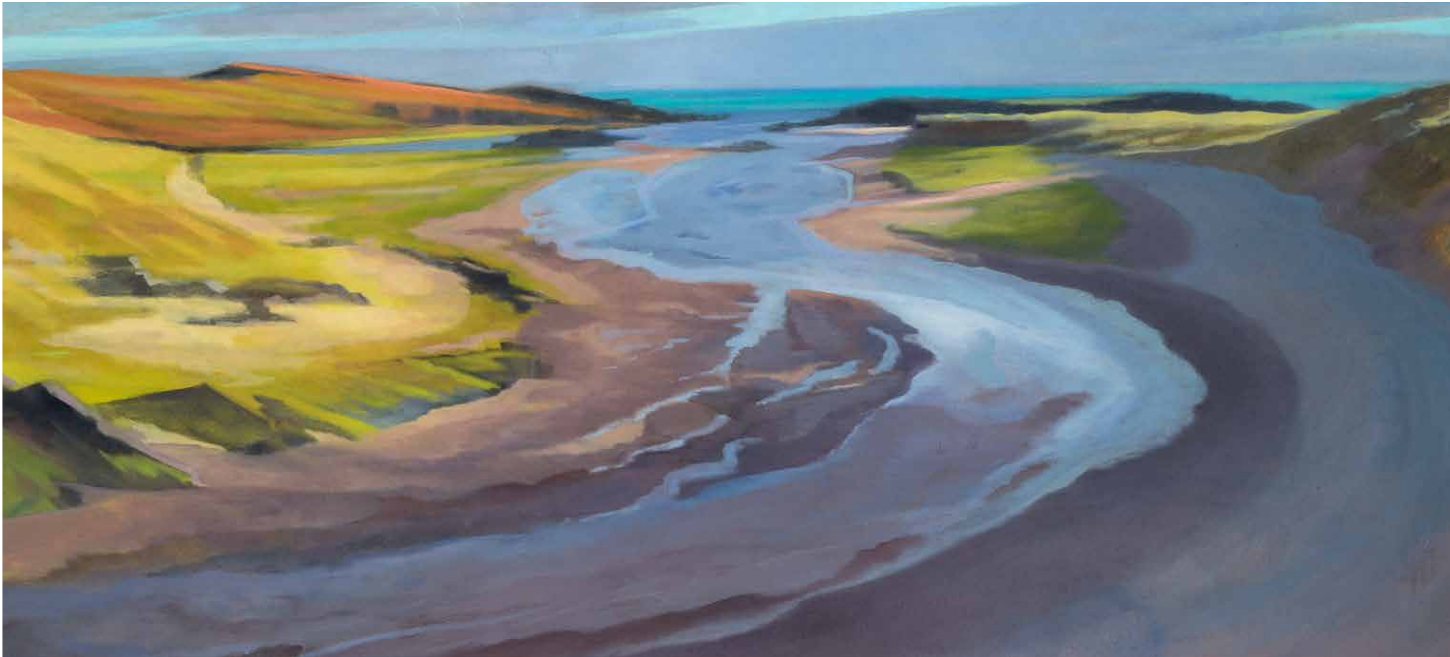
Ebbing Tide, Colonsay oil on canvas 62 x 127 cm