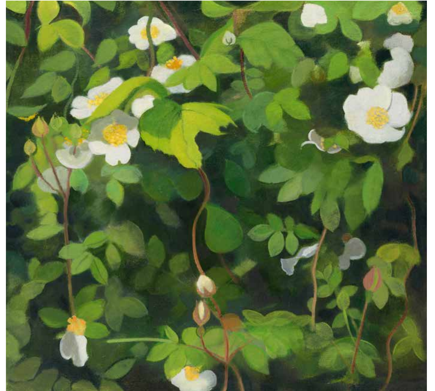
Wild Rose oil on canvas 57 x 61 cm