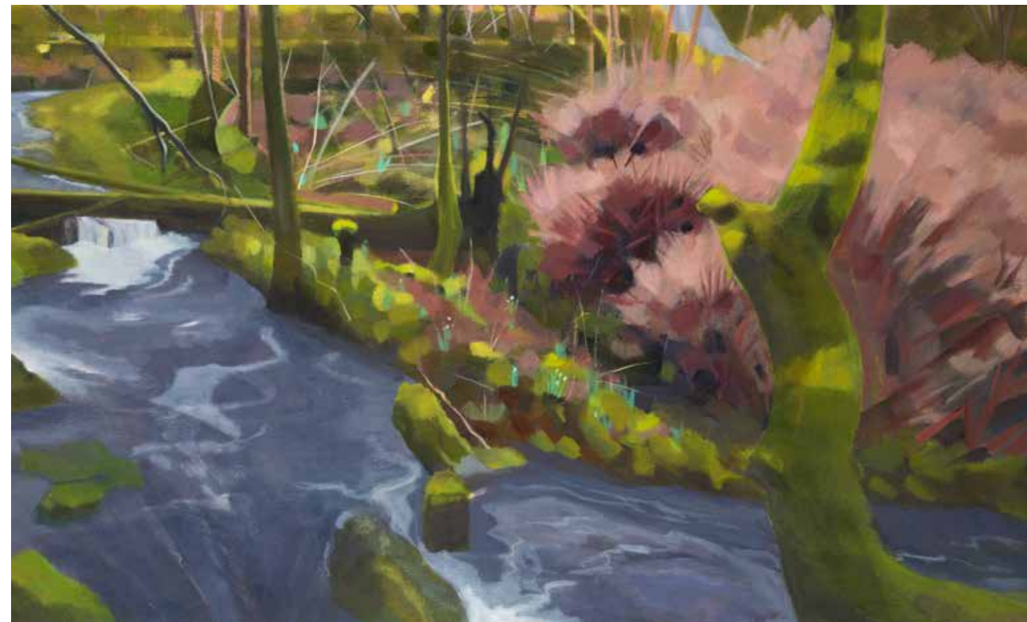
Kilmartin Glen oil on canvas 65 x 95 cm