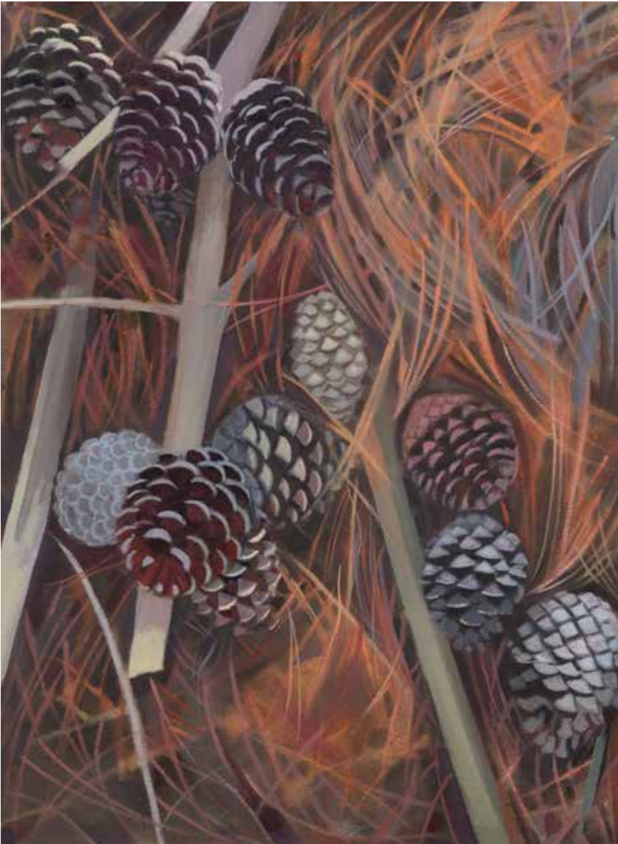
Needles and Cones oil on canvas 74 x 54 cm