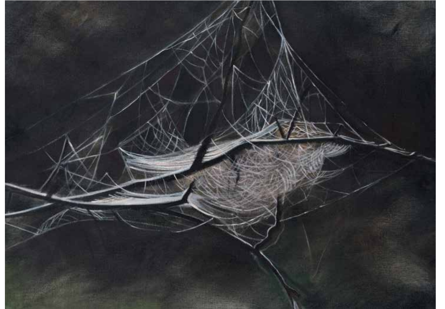
Webbed Thorn oil on canvas 61 x 79 cm