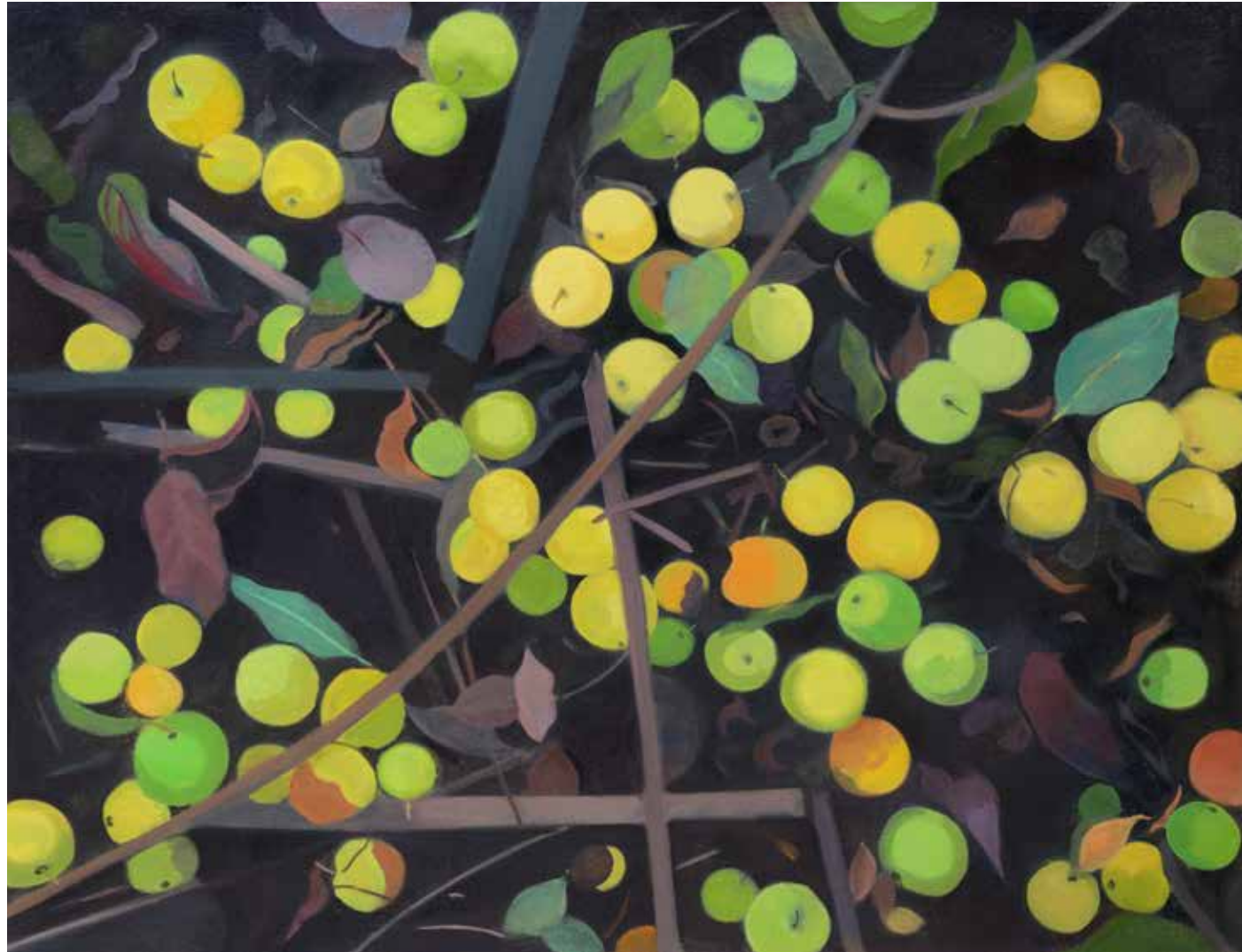
Fallen Crab Apples oil on canvas 66 x 86 cm