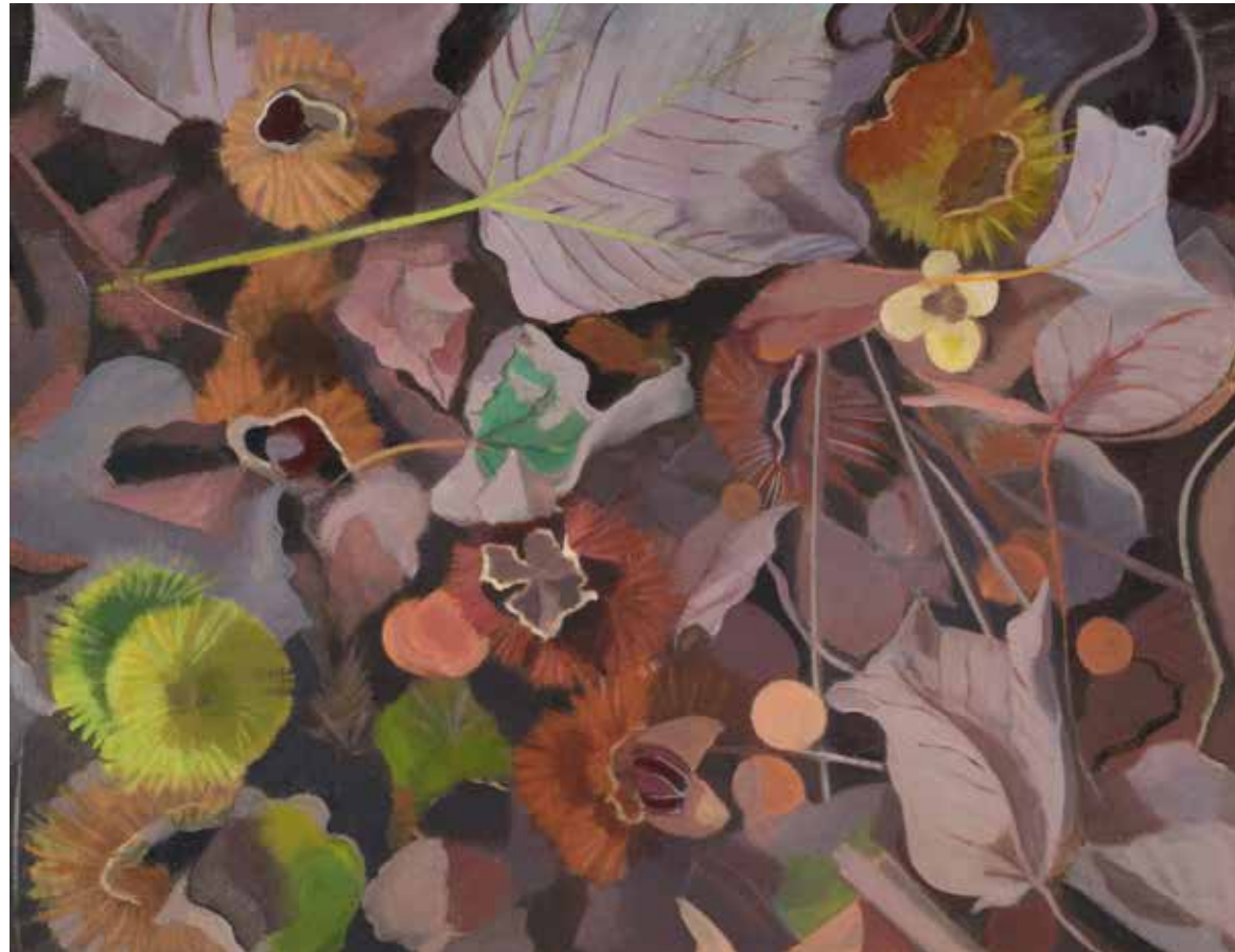
Autumn Floor II oil on canvas 49 x 62 cm