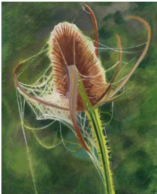
Teasel and Cobweb oil on canvas 47 x 37 cm