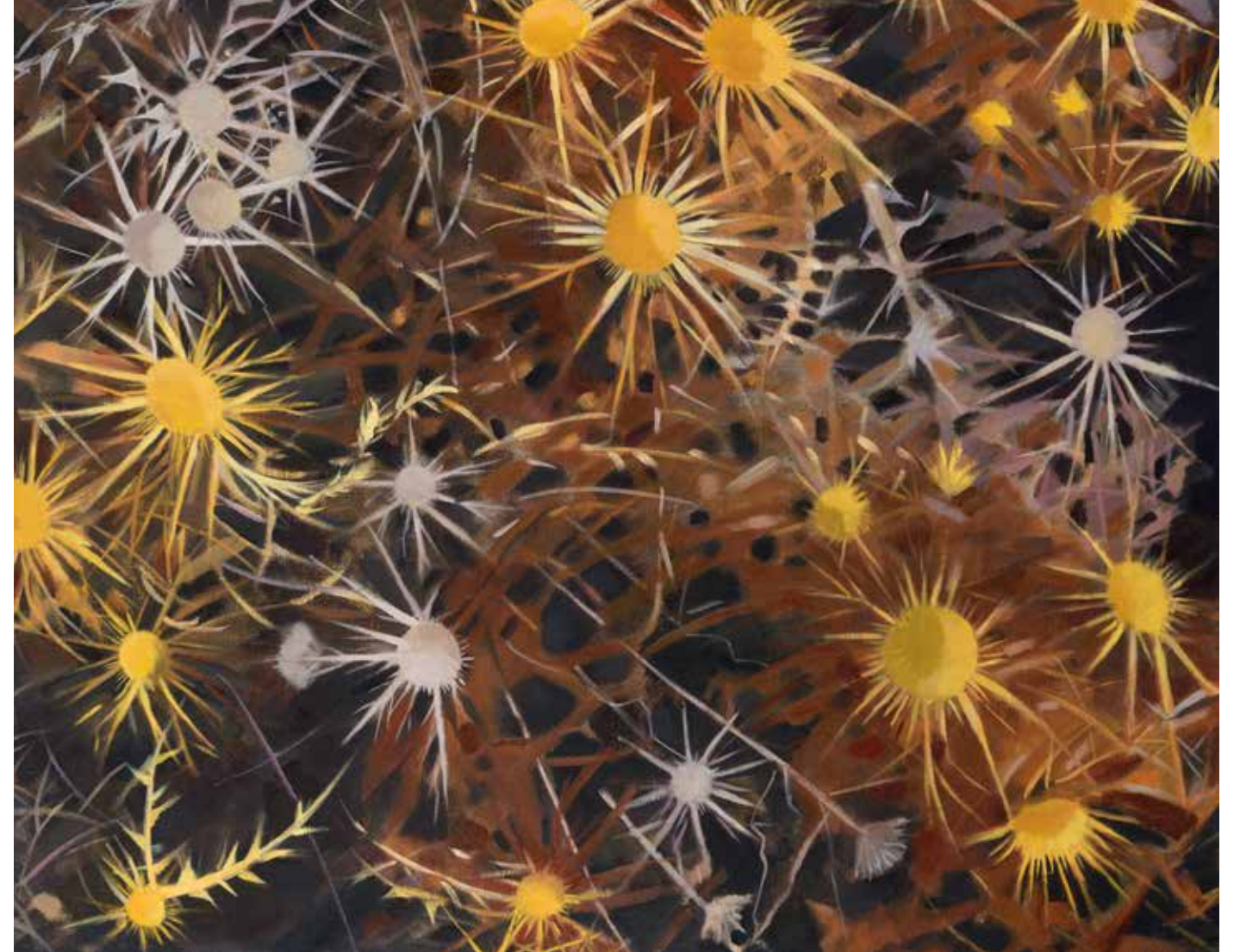
Thistle oil on canvas 62 x 78 cm