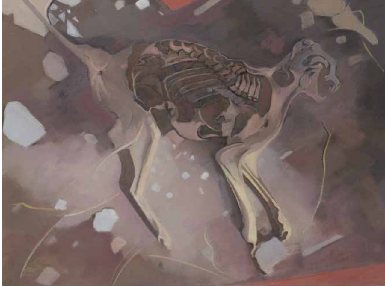
Felis Catus oil on canvas 56 x 73 cm